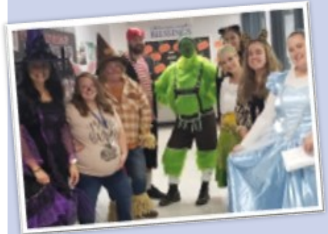
Staff joining in on the Halloween fun.