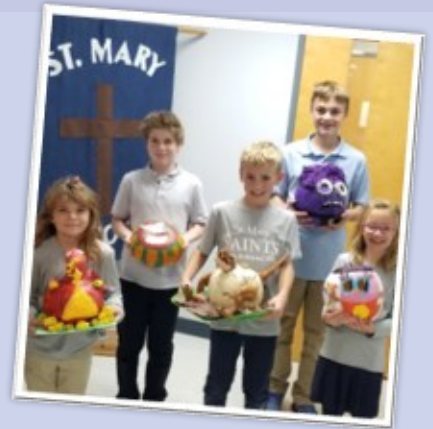
Winners of the Halloween Pumpkin decorating contest.

Serving others brings us all closer to Christ.