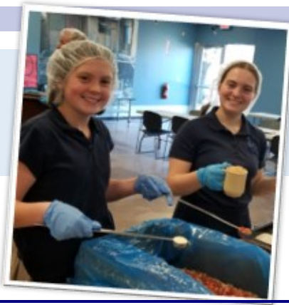
Students volunteering at Feed My Starving Children on Halloween

SMS is holding the Hearts for Haiti Campaign. For every dollar a student brings in, they will have a heart with their name hung in the front hallway. All monies raised will help benefit St. Antoine School in Haiti. Immaculate Conception Parish, St. Patrick Parish, and St. Mary School have partnered together for a number of years to support and help the students of St. Antoine.