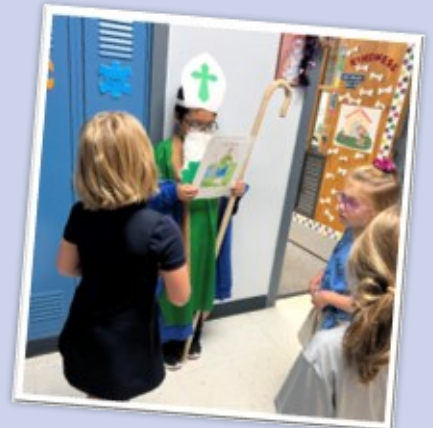
3rd Grade Saints presenting to students.