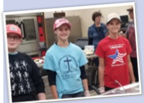
Student Council serving their parish community.