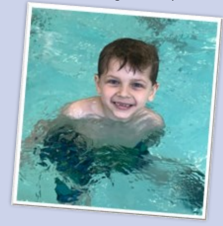
Students visit the Centre in New Richmond twice a year for swimming.