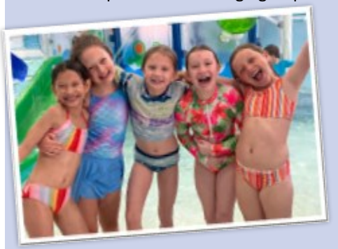
Students had a blast at the Centre during swim day!