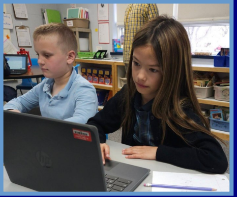
Students MAP testing on Chromebooks