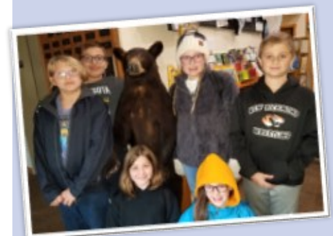
Who is that new student with the 6th graders?