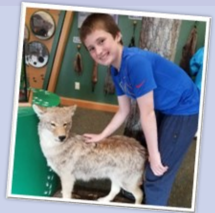
The nature center was full of "friends" to see and study.