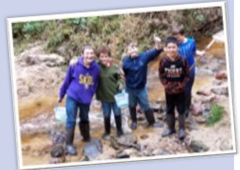
Students did a stream study to test water quality.