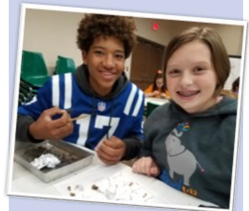
Dissecting owl pellets to see what they had for dinner!