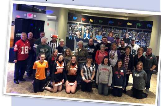
St. Mary Alumni Picture