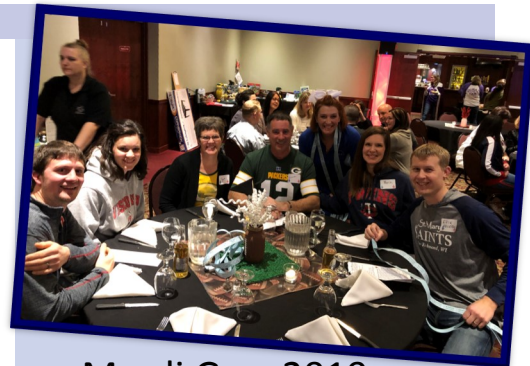
Mardi Gras 2019