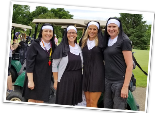
The Sisters Without Misters