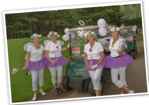
Team Costume Award: The Fairy Godmothers