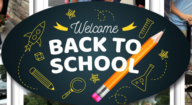
On August 29, teachers and staff welcomed students back to school to begin the 24/25 school year!