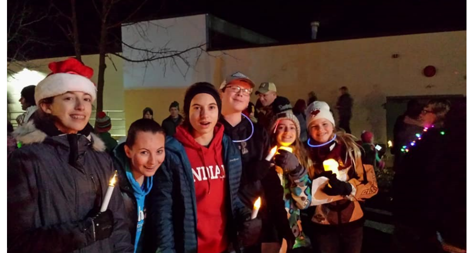
A fun time was had by all in the New Richmond Hometown Holiday parade! Students from St. Mary School and Catholic Formation joined together to represent our two parishes of Immaculate Conception and St. Patrick's.