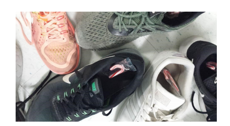
St. Nick visited the school...a sweet treat was left in each student's shoe!