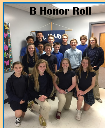
B Honor Roll