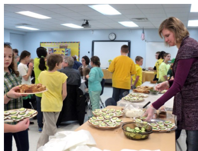
The 4 th & 5 th graders served over 50 alumni and friends in January 2015.