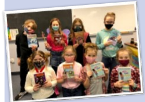
Dress as your Favorite Book Character