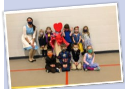
Dress as your favorite Disney Character