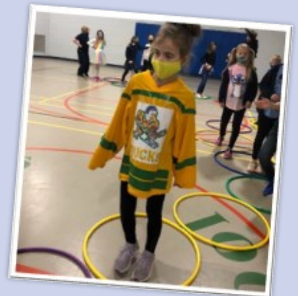
All School Rock, Paper, Scissors Competition