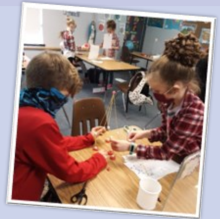
Minute It to Win It Activities

The students and staff participated in a food drive for the local Five Loaves Food Shelf. Students were challenged to raise 500 pounds in food to donate to win a non-uniform day and for Mrs. Jarchow to wear the school uniform. The students brought in over 1700 items weighing in at 1,980 pounds. Third grade brought in the most items and won a class movie and popcorn party. Just another way that students live the school mission and help out locally to those in need.