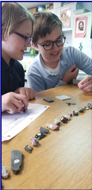
6th grade students completing a rock identification lab in science class.

Teachers are expanding their strategies and techniques in regards to creating a growth mindset culture within the building and using standardized testing results to create individualized plans for each student in the building. Team building activities and opportunities for prayer have also been added to professional development to help build a culture of community with the staff.