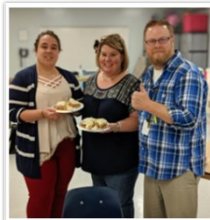
Teachers participating in a team-building exercise during a professional learning day.