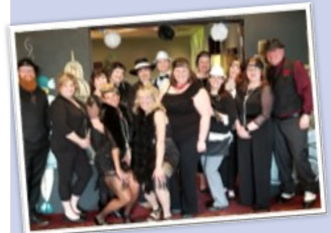
The very talented Mardi Gras