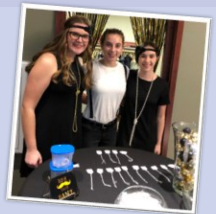
High School Alumni