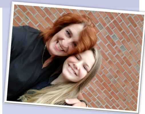
First day of school, everyone was glad to be back!