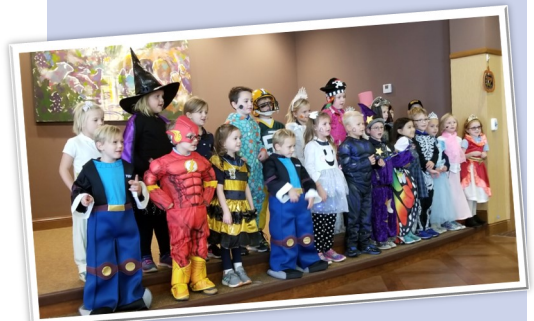
Kindergarten and First grade singing at the Deerfield Care Center