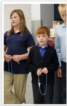
Faith Friends praying the Rosary together in October

Students have been helping through out the community this fall in many different service opportunities. Students have sang at the Deerfield Care Center, packed Happy Kids Backpacks at 5 Loaves Food Shelf, and served meals at Catholic Formation Dinners. Classes have helped to fill Boxes of Joy that will be sent to children around the world. Instead of Halloween celebrations, students in fourth through eighth grade spent a day at Feed My Starving Children packing manna meals for families around the world.