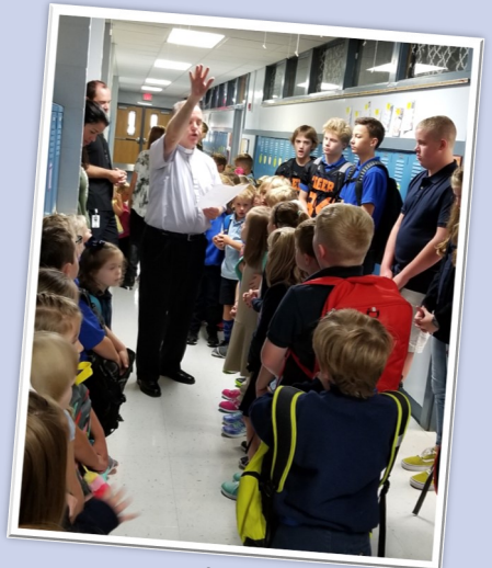
First day of school: